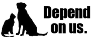
Inner North Veterinary Clinic